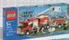
7239 Fire Truck

Build the Rapid Response Fire-Car with pieces from 7239 Fire Truck and 7240 Fire Station!