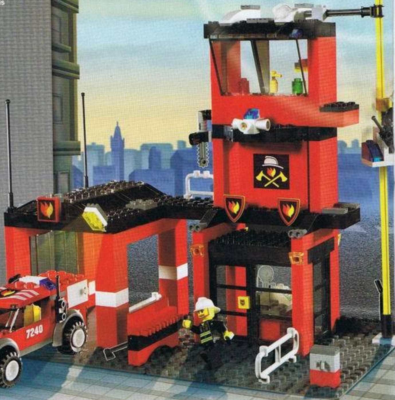
7240 Fire Station

Check out the ultimate LEGO room on Extreme Makeover: Home Edition on Sunday, May 22nd on ABC-TV! See local listings for details.