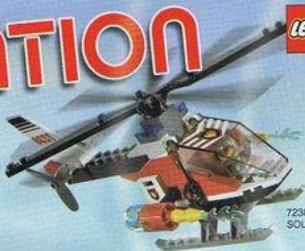
7238 Fire Helicopter SOLD SEPARATELY

The alarm is sounding at the LEGO City Fire Station – but some of the firefighters' most important equipment is missing! Can you find the following items in this picture?