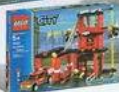
7240 Fire Station